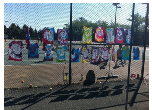
TENNIS KIDS TIE-DYE SHIRTS